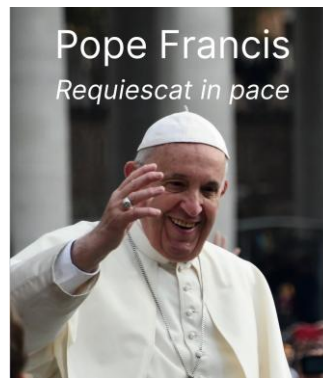
Pope Francis Requiescat in pace

Eternal rest grant unto him, O Lord, ✠ and let perpetual light shine upon him. May he rest in peace. Amen